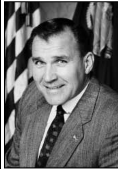
Dynamic Motivational Speaker; Trainer and Consultant